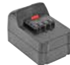
169 020 / 169 021